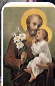
SAINT JOSEPH Pray for Us