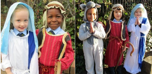
Children in Reception Class have been learning about the Christmas Story.